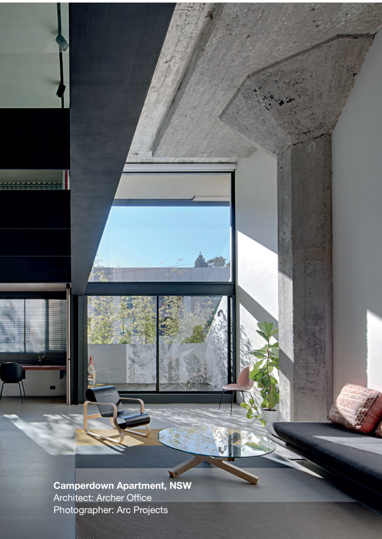
Camperdown Apartment, NSW Architect: Archer Office

Across its life, concrete is a remarkably sustainable construction material, from the sourcing of materials through to design, operation and end-of-life decommissioning and recycling.