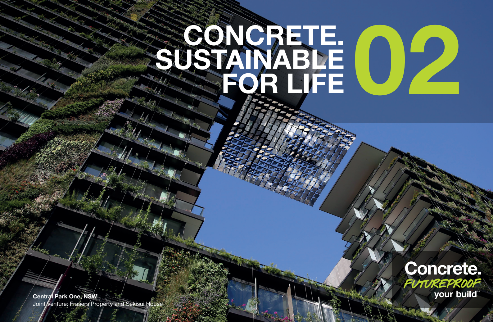
Central Park One, NSW Joint Venture: Frasers Property and Sekisui House