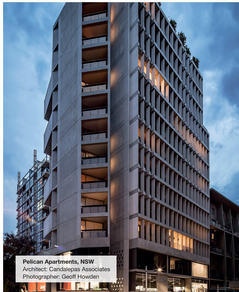
Pelican Apartments, NSW Architect: Candalepas Associates

With concrete you know you are building something that is safe and solid, not only for today but for future generations to come.